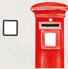
A POST BOX